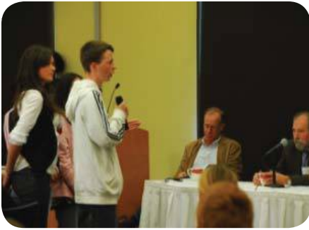
Region 3 ASKED FOR NOTIFICATION OF RIGHTS AT THE AGE OF 12 TO HAVE KNOWLEDGE OF RIGHTS