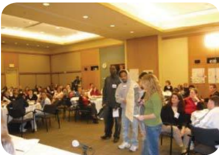
Region 5 ASKING FOR FEDERAL FOSTER CARE AND U.S. FOSTER CARE TO HAVE EQUAL BENEFITS