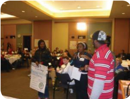
Region 4 ASKING FOR BENEFITS (RESOURCES) FOR KINSHIP CARE