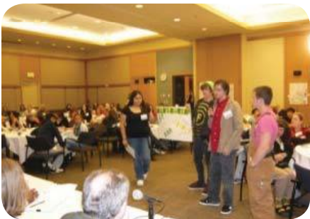
Region 6 ASKING FOR SIBLING VISITATION