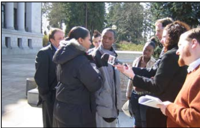
Mockingbird representatives interviewed by media after HB 2002 signing.