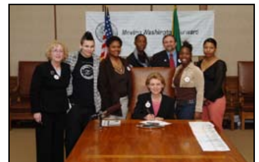
Mockingbird Staff with Washington State Governor Gregoire and Representative Dickerson at HB 2002 signing.