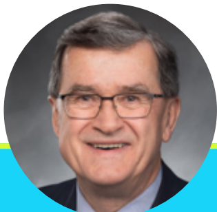
State Senator Curtis King (R)

Senator King was the primary sponsor of the first successful transportation revenue package in more than a decade. The $16 billion infrastructure package funds six transportation megaprojects, more than 140 regional congestion-relief and road safety projects, and invests $1.4 billion for the maintenance and preservation of existing roads.