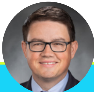
State Representative Chris Corry (R - position 1)

Representative Corry's legislative priorities encouraging job growth by protecting people and businesses from taxes and regulations, prioritizing the rehiring of state workers who lost jobs due to the terminated COVID-19 vaccination mandate for state employees, providing effective and fully funded K-12 education system, providing law enforcement with the necessary tools to ensure public safety, improving Washington's mental health system, protecting parental rights.