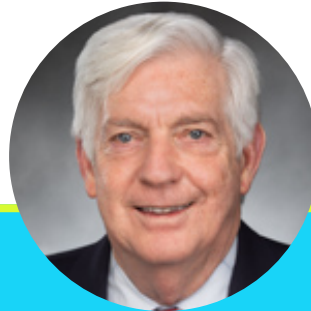
State Representative Bruce Chandler (R - position 1)

Representative Chandler focuses on policies promoting water storage, economic growth and the safety of Washington's families.