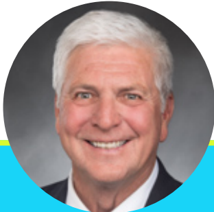
State Senator Perry Dozier (R)

Senator Dozier, born and raised in the 16th Legislative District, is an advocate for the issues important to southeast Washington – a sound business climate, job creation, support for agriculture and education. To Olympia Dozier brings practical skills learned in a lifetime of farming and agricultural affairs. Dozier maintains government should listen to the people and reflect their concerns.