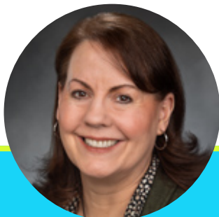
State Senator Ann Rivers (R)

Senator Rivers's priorities include strengthening Washington's economy, protecting the state's taxpayers by prioritizing and controlling state spending, and making sure the projects Southwest Washington needs for a solid transportation system are moving forward.