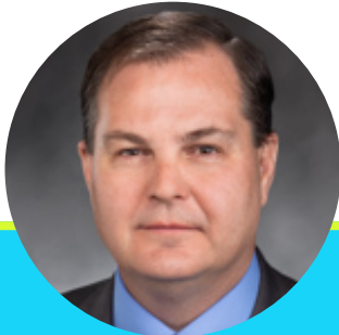
State Senator John Braun (R)

Senator Braun was the lead budget writer and negotiator while chairing the Senate budget committee in 2017 when he sponsored the state's 2017-19 operating budget. His work led to historic investments in the state's public education system and property tax reform aimed at providing full state funding for basic education and a property tax reduction for 73 percent of state residents. He also sponsored and worked to pass the College Affordability Program in 2015, which included the first-ever tuition cut at state colleges and universities.