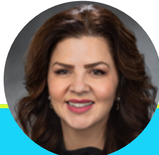
State Representative Kelly Chambers (R - position 1)

Representative Chambers priorities include strengthening Washington state's education system, crafting and supporting policies that create jobs and ease burdens on small business owners, fighting for lower property taxes, and looking for ways to relieve congestion and ease the financial burden on commuters. She also serves as president of the Health Care Providers Council of Pierce County.