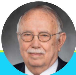
State Senator Steve Conway (D)

Prior to his election to the legislature, Senator Conway was employed as a business agent for the United Food and Commercial Worker's Union, Local 81. During that time, he worked to secure living wages, safe workplaces and equitable benefits for countless working people and their families.