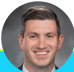
State Representative Drew Stokesbary (R - position 1)

Representative Stokesbary's priorities are to reduce taxes and irresponsible budget growth, hold state agencies accountable for waste and fraud; encourage job creation and economic growth across WA state; protect our communities from crime and drug use, prohibit drug injection sites; and fully fund K-12 education to ensure college is affordable and accessible.