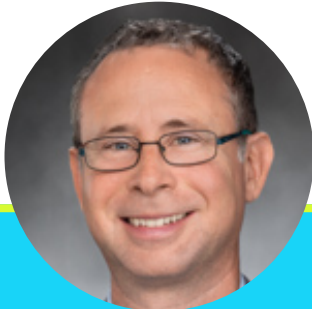
State Senator Jesse Salomon (D)

Senator Salomon served on the Shoreline City Council and currently works part-time as a public defender. He is on the Hate Crimes Task Force to strengthen our approach to reducing racism, homophobia, and related bias crimes and incidents. He is a champion for the environment, youth and children, and justice system reform. His sponsored bills include ensuring the safety of employees during pandemics and emergencies, preventing license suspensions for low-income Washingtonians, and more. His committees include Agriculture, Water, Natural Resources & Parks (Vice Chair), Local Government, Land Use & Tribal Affairs (Vice Chair), Law & Justice, and Rules.