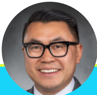
State Senator Joe Nguyen (D)

Senator Nguyen advocates for working families and community members who historically have been left out of the political process. He has championed legislation to modernize and increase access to basic needs program, help make historic investments in affordable housing and alleviate the homelessness crisis, reform our criminal justice system, mitigate the climate crisis and provide students equal access to education.