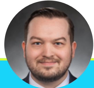
State Representative Travis Couture (R - position 2)

A U.S. Navy Veteran, Rep. Travis Couture understands what service and sacrifice mean. He patrolled the Pacific as a submariner while stationed with Ballistic Missile Submarines USS Alabama and USS Nebraska, successfully completing multiple strategic deterrence patrols.