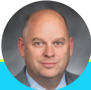
State Senator Drew MacEwen (R)

Senator MacEwen is an advocate for public safety, better schools, government accountability, tax relief, and economic growth and greater opportunity.