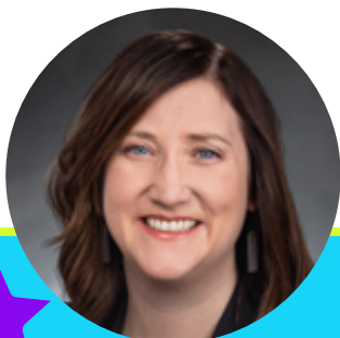
State Senator Noel Frame (D)

Senator Frame has taken on challenges to reform our criminal legal system, build more affordable housing, strengthen and investing in the diverse communities that make up WA state, balance our tax code, and more. She has advocated for youth involved in the foster care and juvenile justice systems and to expand services for individuals with intellectual, developmental and behavioral health challenges.