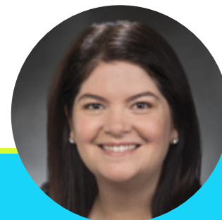
State Representative Liz Berry (D - position 2)

Representative Berry is an advocate for working families who rely on affordable childcare and the public education system, combating climate change, building vital infrastructure that is safe, equitable, and green, and the legal rights of patients, consumers and injured workers. She is a lifelong champion for women in leadership and reproductive justice.