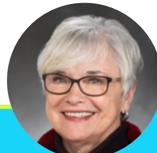
State Representative Carolyn Eslick (R - position 2)

Representative Eslick's commitments include finding solutions to mental health, housing, and public safety issues. She is an advocate for the prevention and rehabilitation of adult and teen substance abuse.