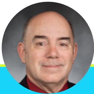
State Senator Keith Wagoner (R)

Senator Wagoner's priorities include innovative solutions to provide safe and affordable housing, advocating for veterans, protecting 2nd amendment rights, ensuring access to behavior and mental health facilities, addressing the growing opioid epidemic and protecting private property rights.