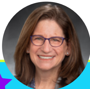
State Representative Tana Senn (D - position 1)

Representative Senn advocates for issues affecting busy families and seeks solutions to address mental health, economic and environmental justice, and education equity.