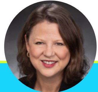
State Representative Amy Walen (D - position 2)

Representative Walen's leadership includes transportation infrastructure and strategic economic development projects.