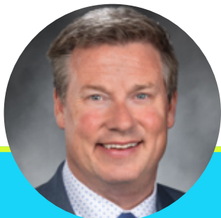
State Senator Mark Mullet (D)

Senator Mullet is widely recognized as a collaborative legislator skilled at bringing people together across the aisle to work on major issues like affordable housing, access to college, and public safety.