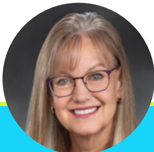
State Representative Mary Dye (R - position 1)

Representative Dye is invested in the environment of the city, and deeply committed to restoring the infrastructure needed to sustain the natural resource economies in rural communities.